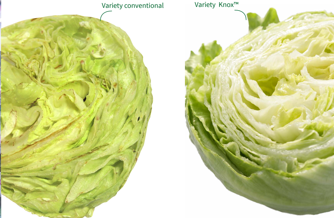
Shelf life test Wholehead Lettuce