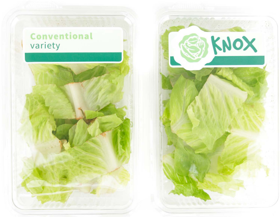
Shelf life test Fresh cut Cos Lettuce